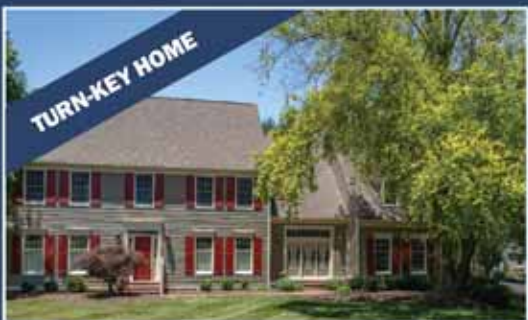
Great Falls $1,150,000