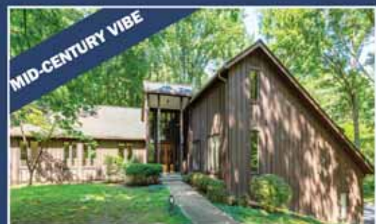
Great Falls $990,000