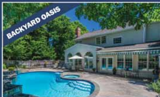
Great Falls $1,249,000