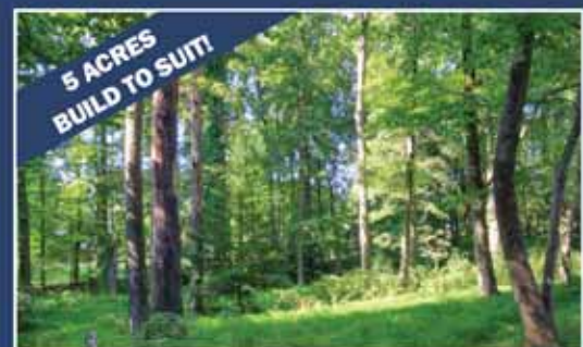
Great Falls $1,199,000