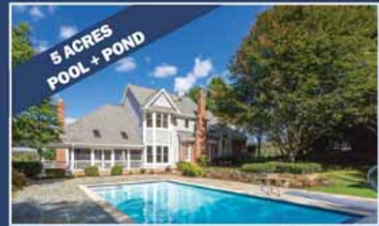
Great Falls $2,499,000