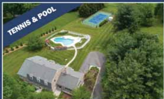
Great Falls $1,150,000