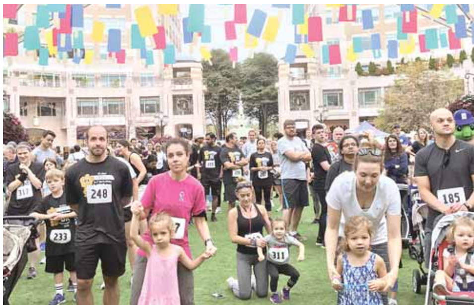
Parents help their children during warm-ups before the start of the 5th annual 5K & Family Health Fair: Race To Make It All Better at Reston Town Center to benefit the nonprofit medical group practice, Pediatric Specialists of Virginia (PSV) located in Fairfax.