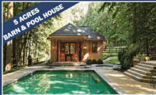
Great Falls $1,995,000