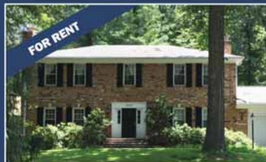
Great Falls $3,950