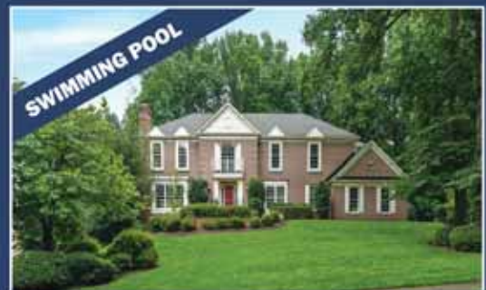
Great Falls $1,399,000