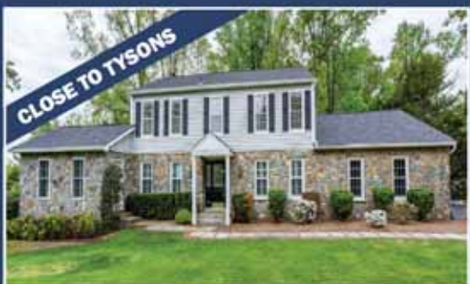
Great Falls $1,140,000