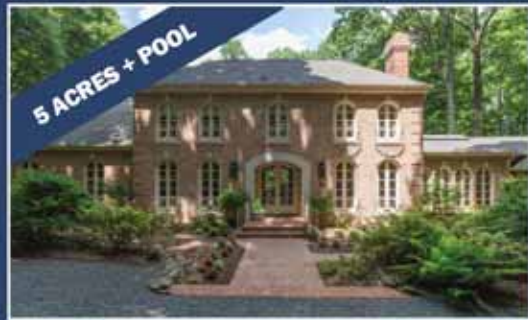
Great Falls $2,499,000